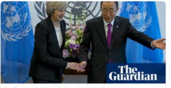
Ban Ki-moon tells Britain: stop investing in fossil fuels overseas Former UN secretary-general says country must live up to Theresa May's commitment theousingless com

Good to see former UN secretary-general Ban Ki-moon following @CommonsEAC inquiry into UKEF. He is right - we need to stop funding fossil fuel projects overseas.